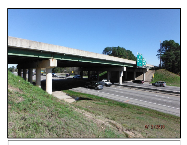
Photo 1 - View of the subject bridge, S-40-757 (Harbison Blvd) Bridge over I-26 looking up-station (Westward).

The existing bridge structure (~265.0'L x 63.0'W, inside curb to inside curb), is located on S-40-757 (Harbison Blvd.) and crosses over I-26 in Richland County, South Carolina. The bridge (SCDOT bridge #407075700100) was constructed in 1981 according to the date stamped on the bridge's concrete guardrail. The bridge was constructed in 1981 according to the date stamped on the bridge's concrete guardrail. The bridge is a four-lane, four (4) span bridge constructed with poured-in-place concrete bridge deck spans, concrete curb and gutters and concrete guardrails. Each span is supported by ten (10) steel beams with steel diaphragms. The bridge beams are supported by two (2) end bents and three (3) interior bents. According to the SCDOT bridge drawings provided, and through onsite